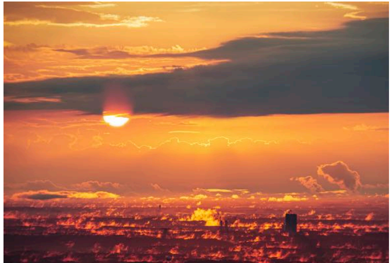
Color Digital 1st place by Barb Staggs