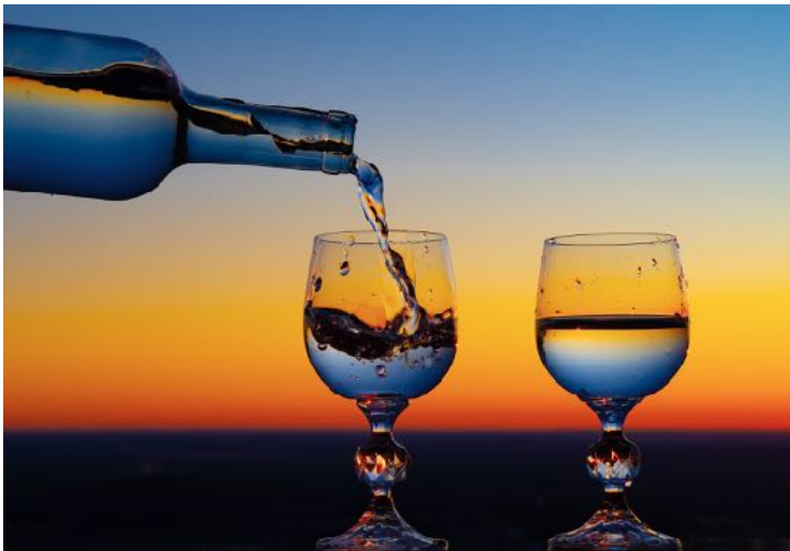
Color Digital 2nd place by Barb Staggs