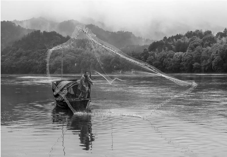
Monochrome Digital 1st Place by CT Chi