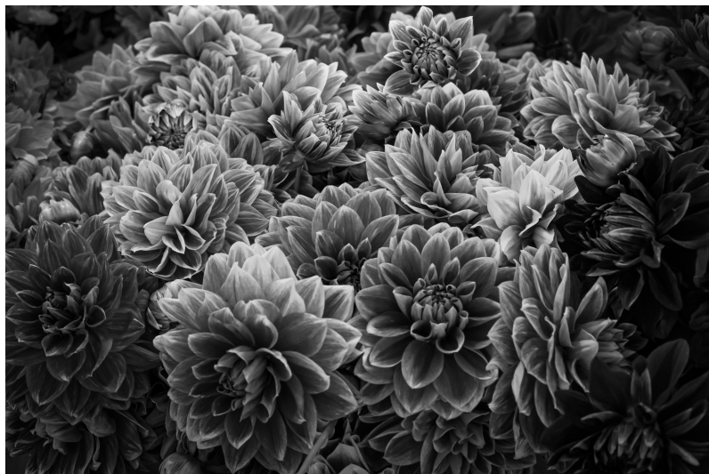
Monochrome Digital 3rd Place by Matt Bevill