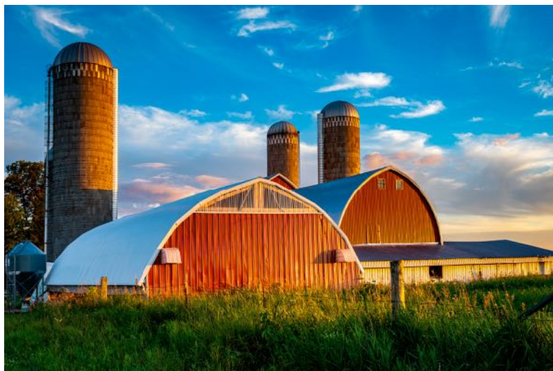
Color Digital 3rd place by Earl Todd