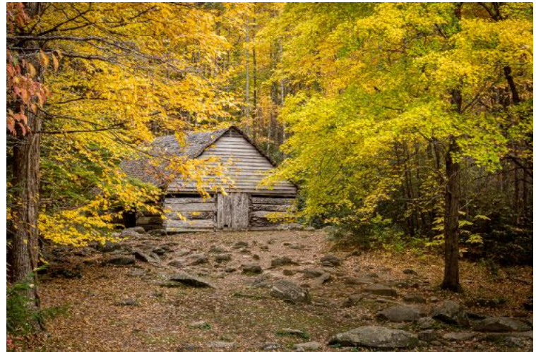
Color Digital 2nd place by Ed Townsend