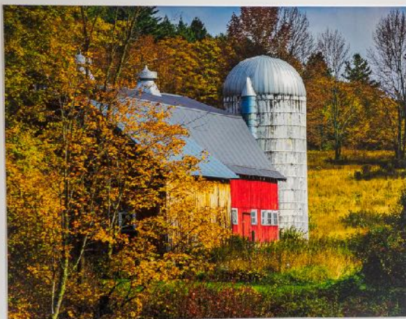
Color Print 1st place by Earl Todd