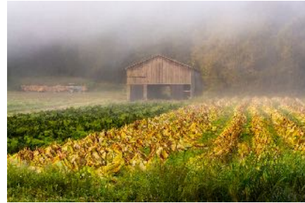
Color Digital, HM, by Jack Eidson. See more winners starting on p. 7.