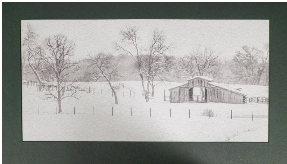
Monochrome Print 2nd place by Phillip Flowers