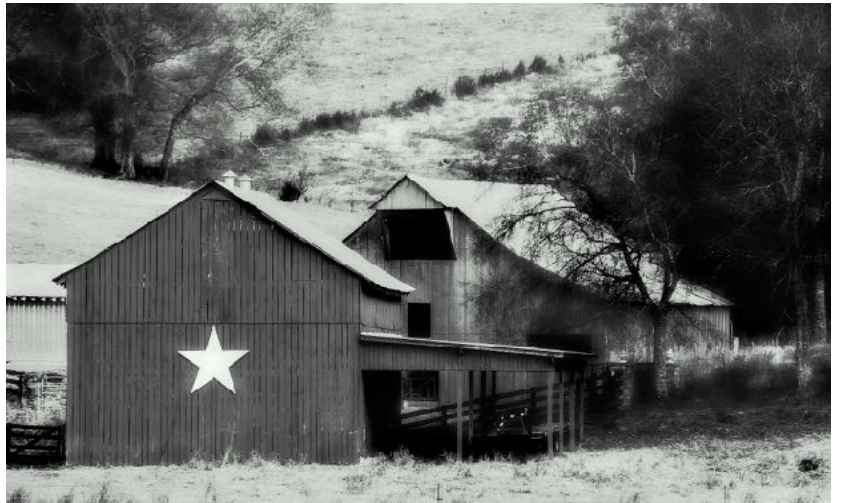
Monochrome Digital 1st place by Eddie Sewall