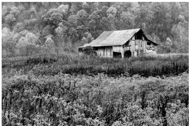
Monochrome Digital 3rd Place by Ed Townsend