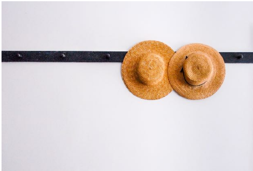
Color Digital 2nd Place by Ed Townsend