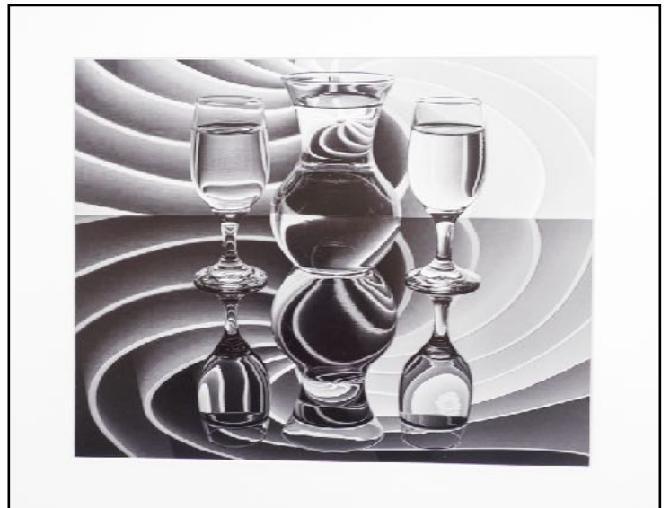
Monochrome Print 2nd place by Earl Todd