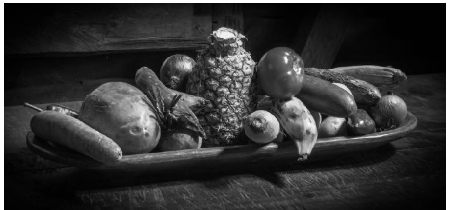
Monochrome Digital 2nd place by Emily Saile