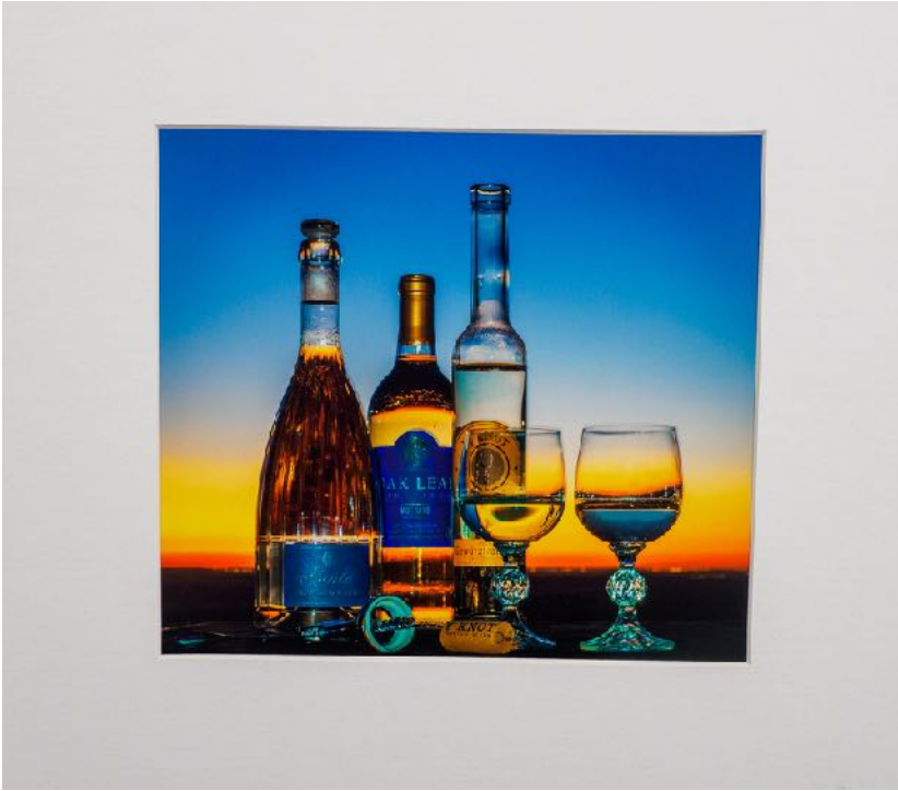
Color Print 3rd place by Barb Staggs