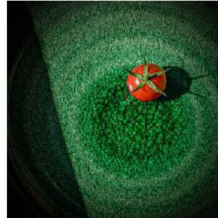
Color Digital, HM by Phillip Flowers. See p. 6 for more winning images.