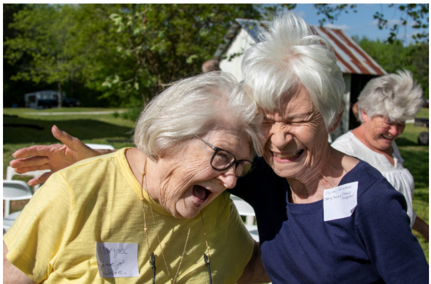
Color Digital 3rd place by Alice Searcy