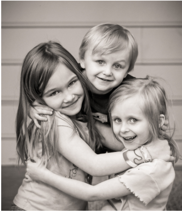
Monochrome Digital 1st place by Philip Flowers