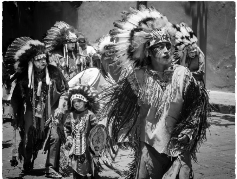
Monochrome Digital 2nd Place