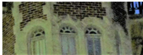
Crop of Camera JPG

Here is the test image, ISO 8,000, 1/15 second, f/5.6. It is the flatiron building in Eureka Springs. I made a crop around the second story window to see the effect of different processing. For comparison, I made a crop of the out-of camera JPEG that only had the on-board noise reduction. The image shows noise and lack of detail that is expected from this vintage camera and on-board processing only. In 2019 I ran the image through my normal