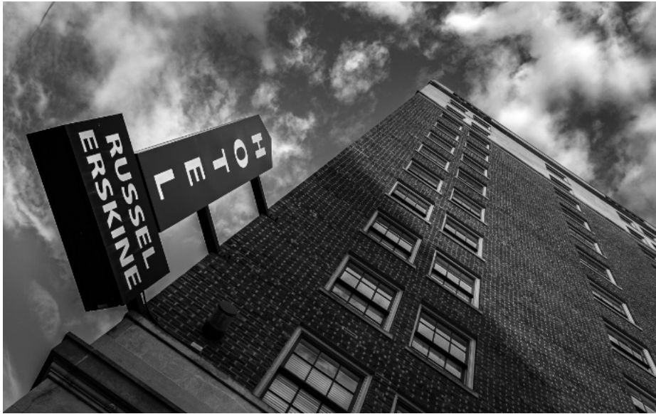
Monochrome Digital 1st place by Earl Todd