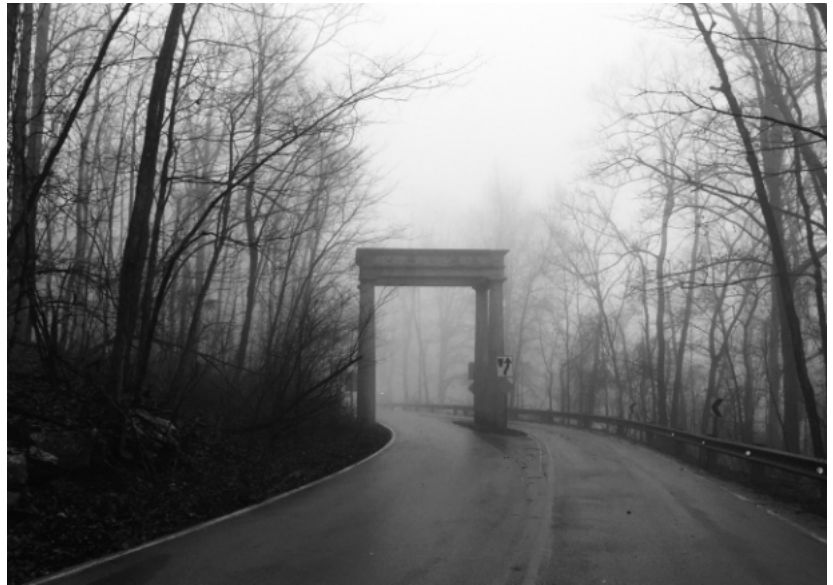
Monochrome Digital 2nd Place