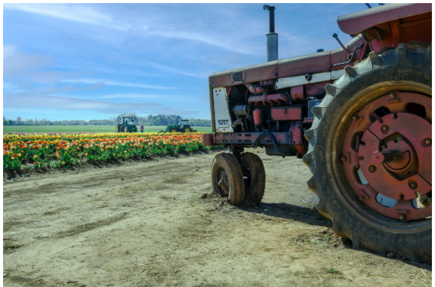
Color Digital 3rd place by Jack DeBlanc