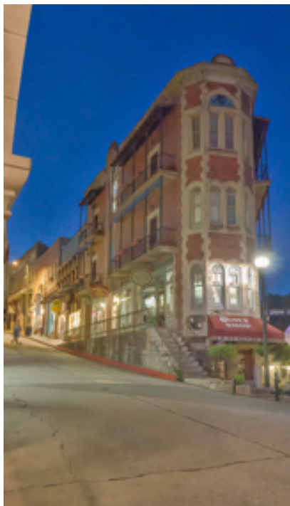
Test Image-ISO 8000

Sunset cityscape shots when the sky has gone cobalt blue and incandescent lights are on and glow orange make a nice complementary color photo. We had just arrived in Eureka Springs, Arkansas, and it was past the golden light. Too late and no time to set up a tripod. So I cranked the ISO up to 8,000 and made a hand-held shot that I'll use here as a test. It was made in 2014 so that technology produced a noisy image suitable for testing.