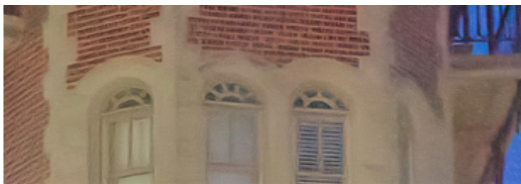
A.I. Clear, Adjust, LR (2019)

workflow. Shoot in RAW, open in LR with preset of some sharpening, noise reduction, and lens correction. (All RAW images need some sharpening since it is not done in-camera). The next step was to open in AI Clear and