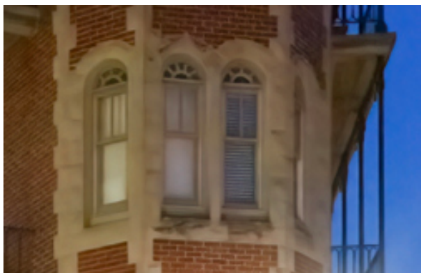
LR, SharpenAI, DeNoiseAI, LR (2022-1)

The entire process was repeated in 2022 in case some software updates elsewhere had improved things. Shot in RAW, opened with LR presets. Did small Exposure, Highlights and Shadows adjusts in LR as well as Vertical Transform for perspective. The next step was to export as a TIFF and open in Sharpen AI. It has several modes of operation and I picked Motion Blur for this image. Then to DeNoiseAI for noise removal, which was significant since the noise had been sharpened. This is the workflow recommended by Topaz. Then back to LR to produce the crop shown. It is definitely better than the 2019 image.