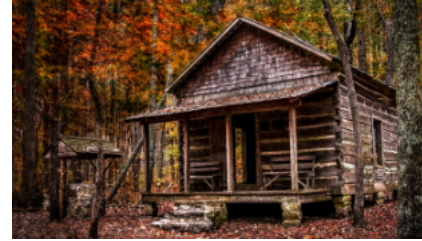
Color Digital, HM, by Don Wolfe. See more HMs starting on p.12.