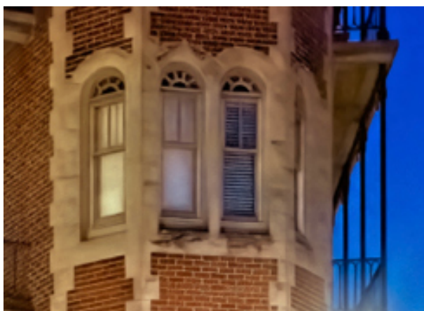
LR, SharpenAI, DeNoiseAI, AdjustAI, LR (2022-2)

The entire process was repeated in 2022 in case some software updates elsewhere had improved things. Shot in RAW, opened with LR presets. Did small Exposure, Highlights and Shadows adjusts in LR as well as Vertical Transform for perspective. The next step was to export as a TIFF and open in Sharpen AI. It has several modes of operation and I picked Motion Blur for this image. Then to DeNoiseAI for noise removal, which was significant since the noise had been sharpened. This is the workflow recommended by Topaz. Then back to LR to produce the crop shown. It is definitely better than the 2019 image.