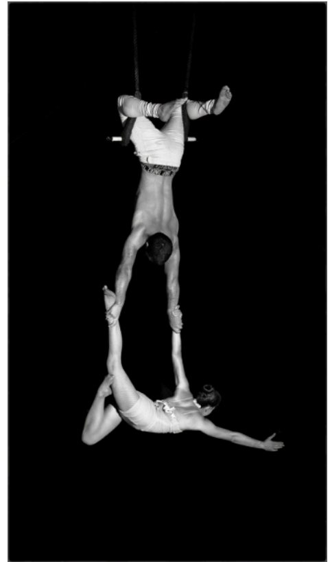
Monochrome Digital 1st place by CT Chi