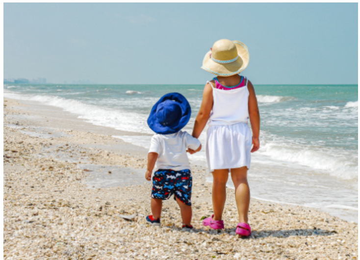
Color Digital 2nd place by Ed Townsend