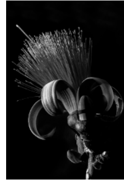
Digital Monochrome, HM, by Jack Eidson. See more HMs starting on p.12.