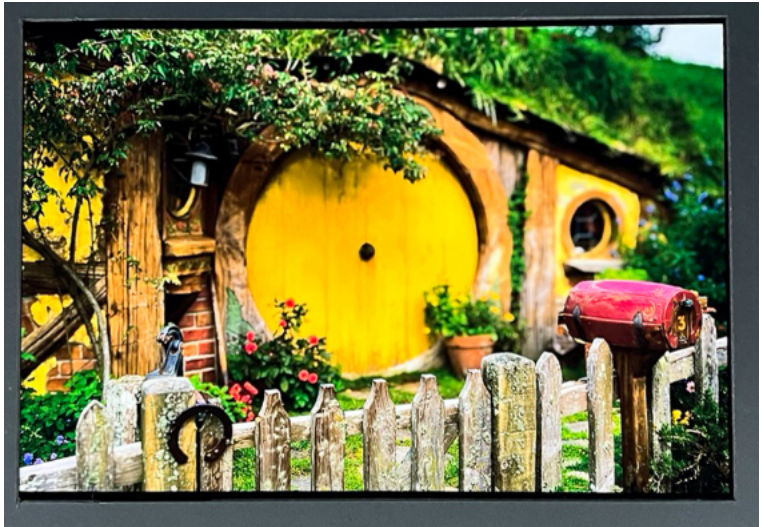
Color Print 2nd place by Eddie Sewall