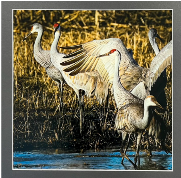
Color Print 3rd place by Philip Flowers