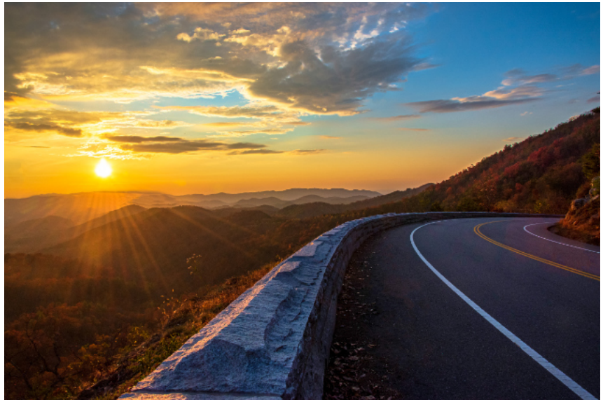
Color Digital 2nd place by Gail Patton