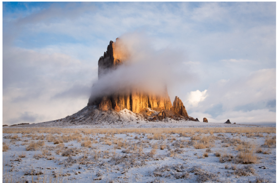
Color Digital 2nd place by Susan Poston