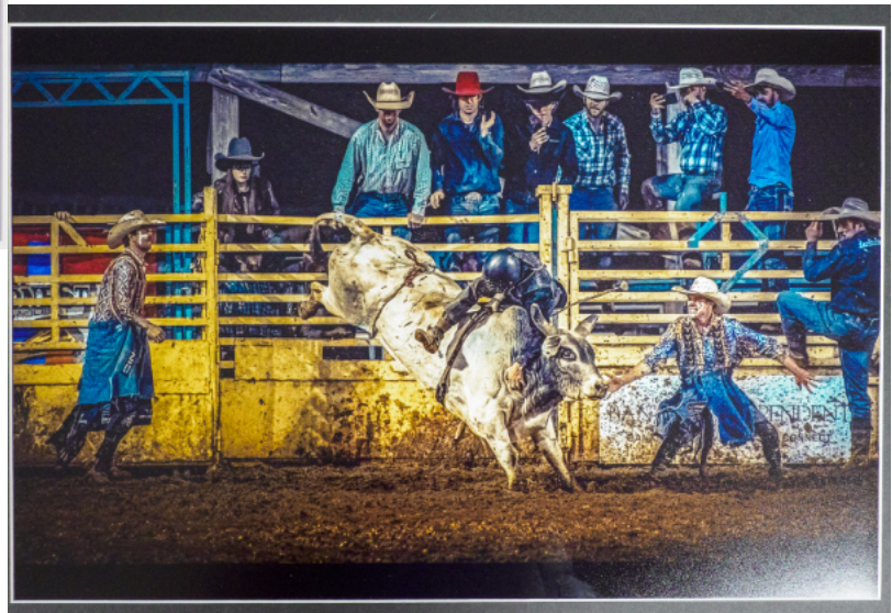
Color Print 2nd place by Philip Flowers