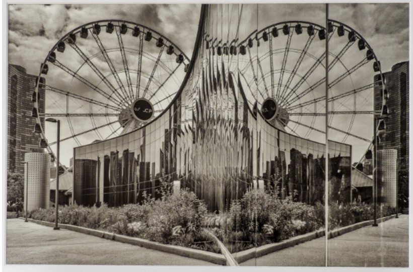
Monochrome Print 1st place by Earl Todd