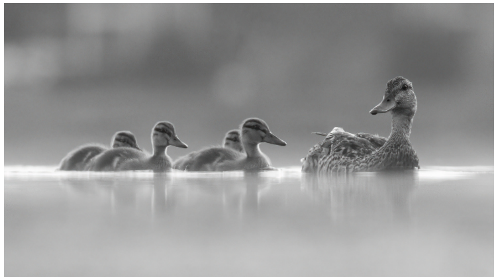
Monochrome Digital 3rd Place by Mat Bevill