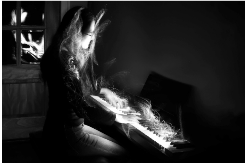
Monochrome Digital 1st place by Emma Soto