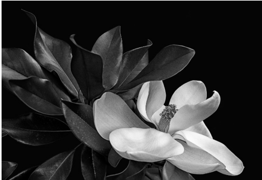
Monochrome Digital 2nd Place by Carol Eidson