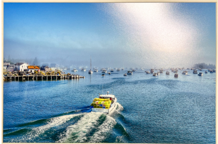
Color Print 2nd place by Charles Leverett