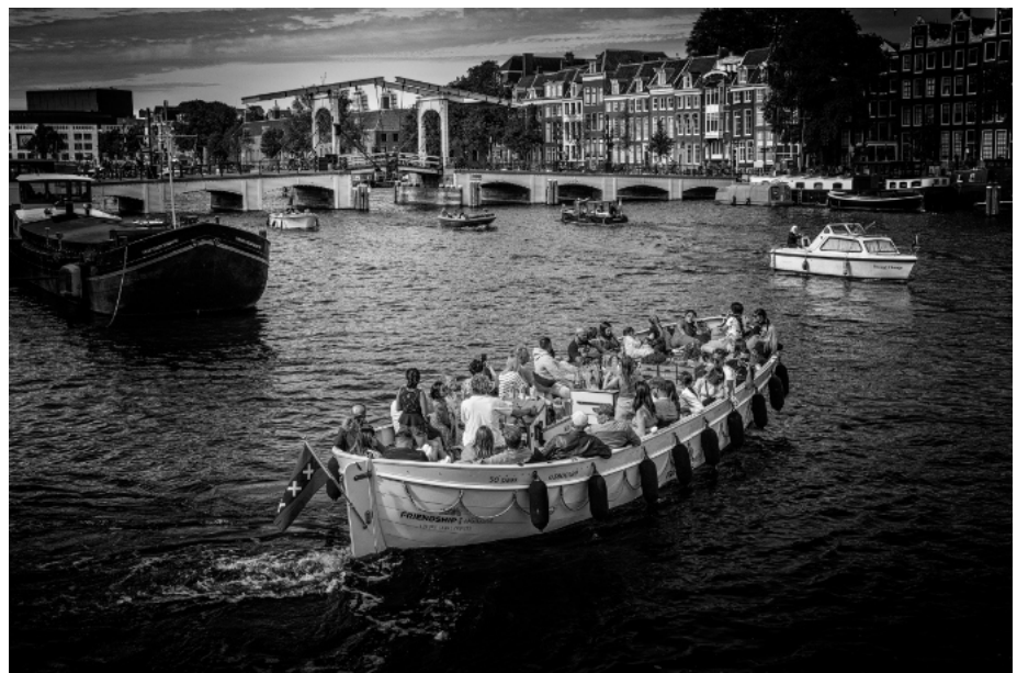
Monochrome Digital 3rd Place by Jack Eidson