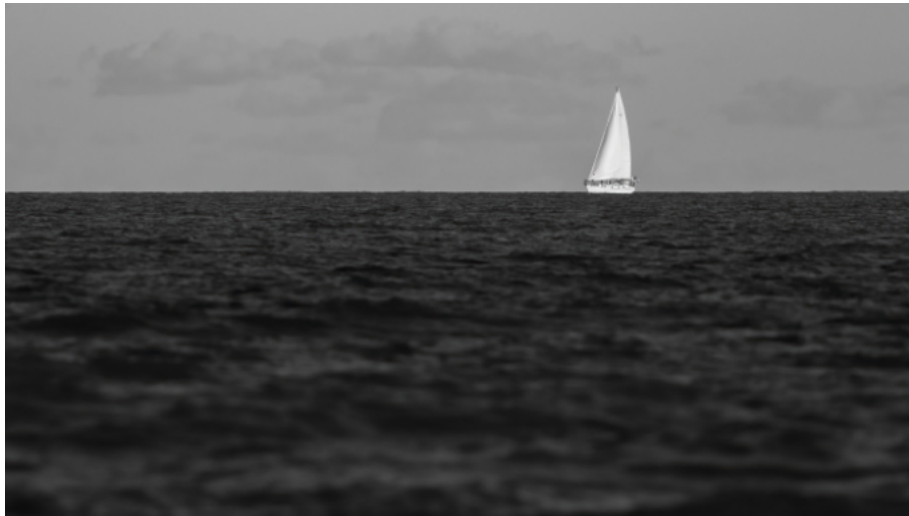
Monochrome Digital 2nd Place by Mat Bevill