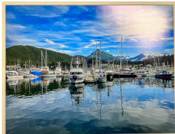
Color Print 3rd place by Emily Salle