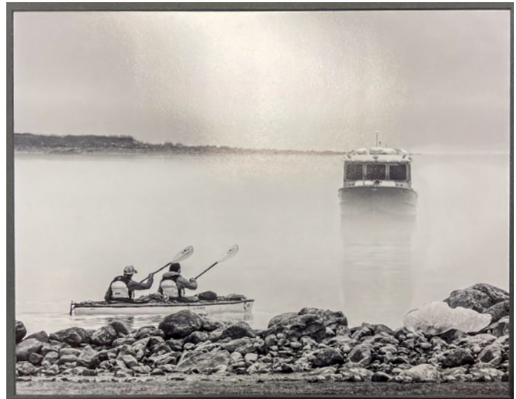
Monochrome Print 3rd place by Emily Salle