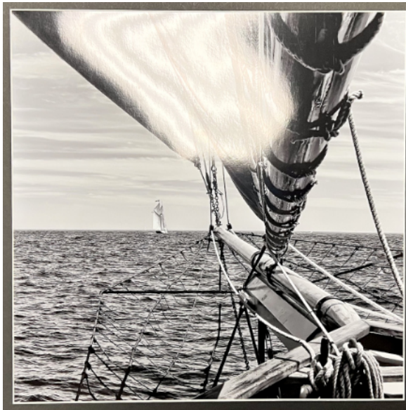
Monochrome Print 2nd place by Charles Leverett