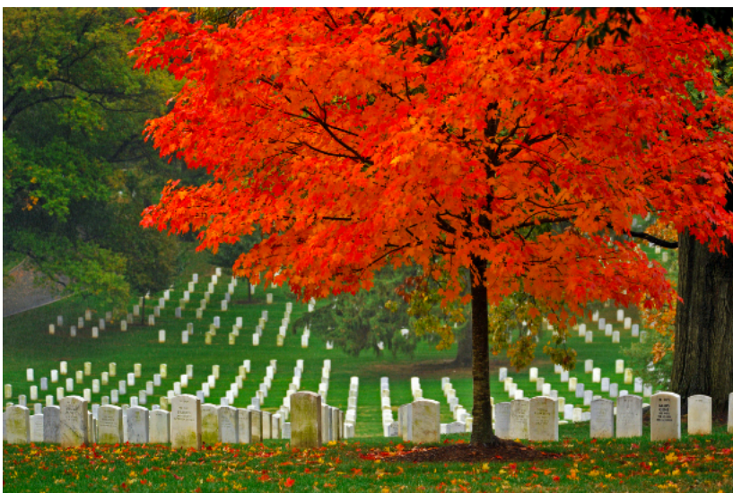
Color Digital 3rd place