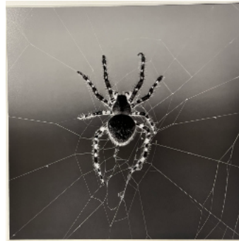
Color Print, HM, by Earl Todd. See more HMs starting on p.10