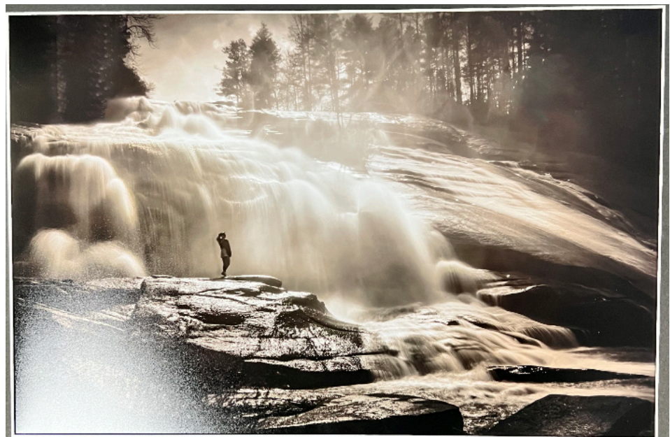
Monochrome Print 3rd place by Philip Flowers