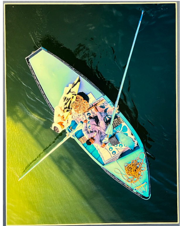
Color Print 2nd place by Philip Flowers