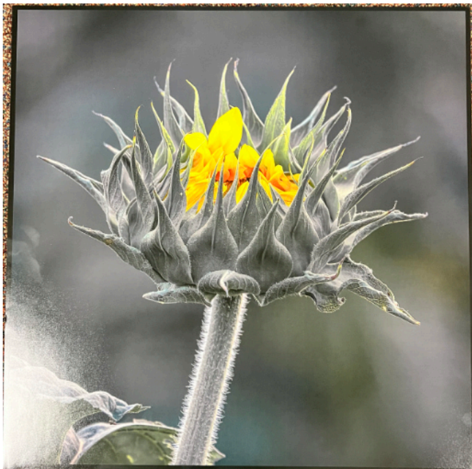
Color Print 3rd place by Eddie Sewall