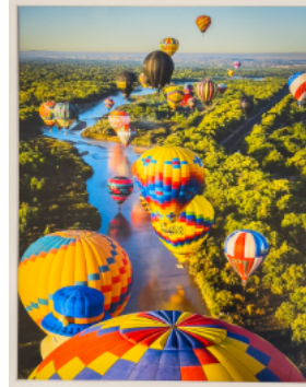
Color Digital, HM, by Emily Saile. See more HMs starting on p.12