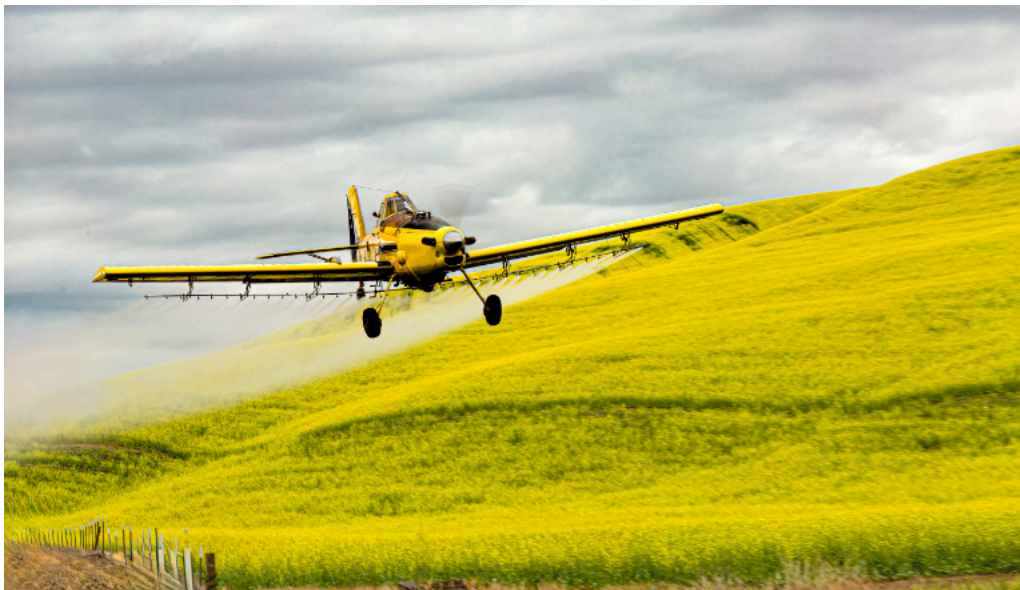
Color Digital 2nd place by Don Wolfe