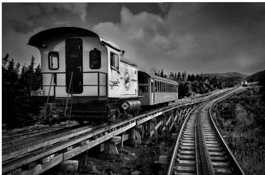
Monochrome Digital 2nd place by C. T. Chi