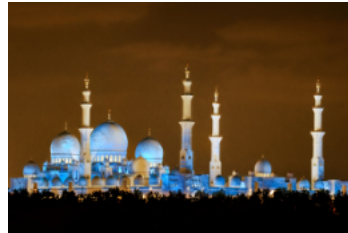
Color Digital HM, by Ahmed Nassar, See more HMs starting on p.10