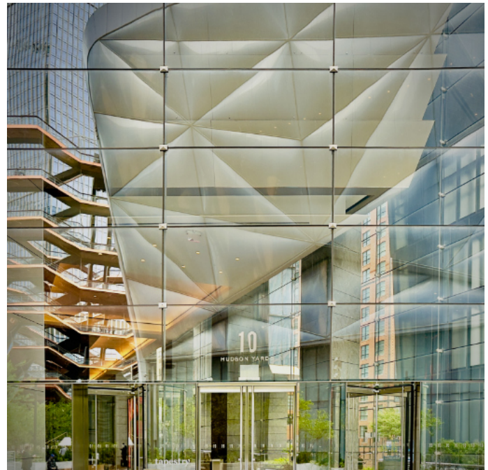
Color Digital 2nd place by Susan Poston